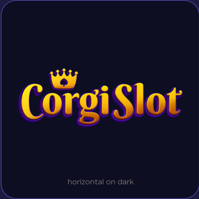
horizontal on dark