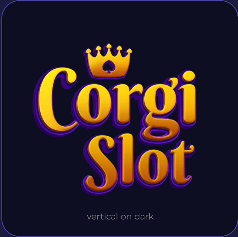
vertical on dark