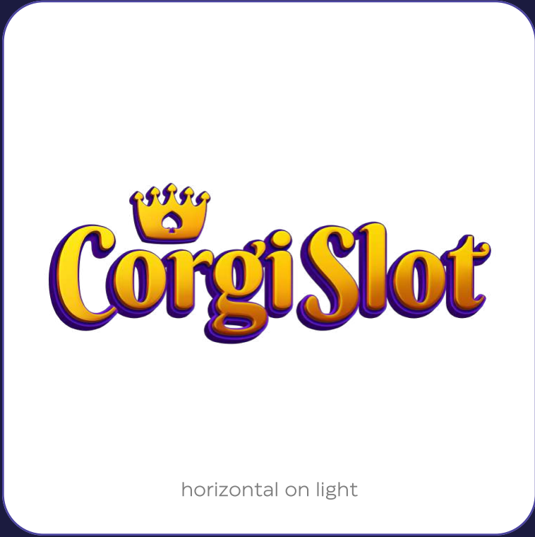
horizontal on light