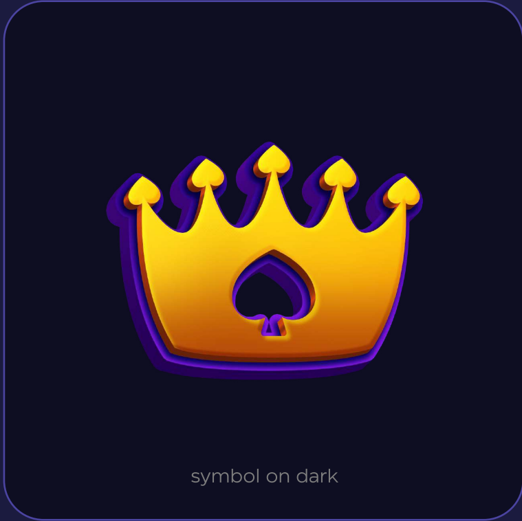
symbol on dark