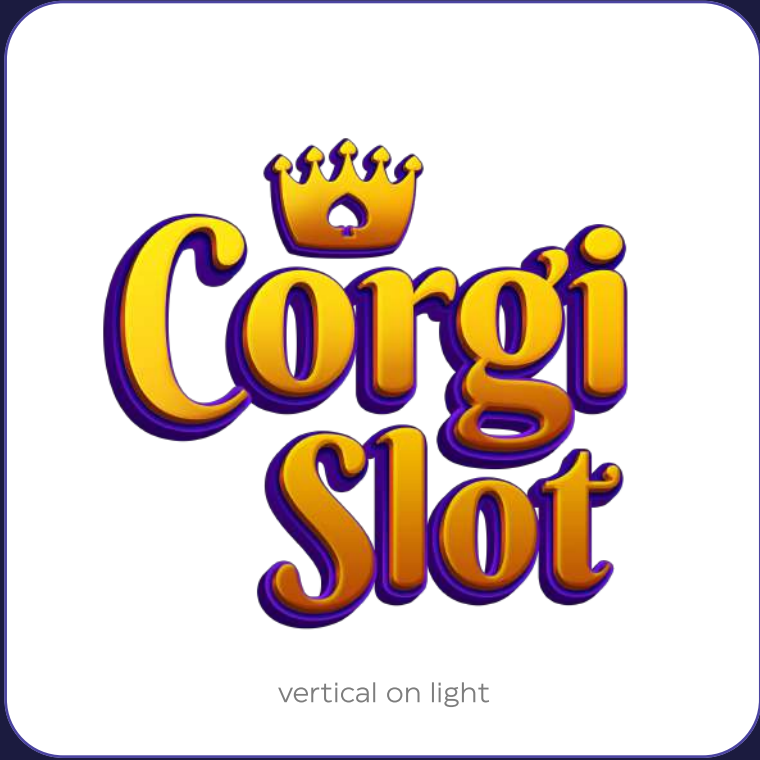
vertical on light